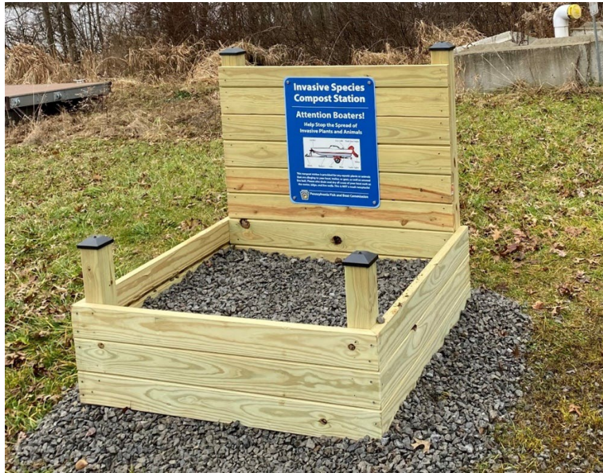
Figure 1. AIS Composting Station installed at Tamarack Lake, Crawford County, Pennsylvania.