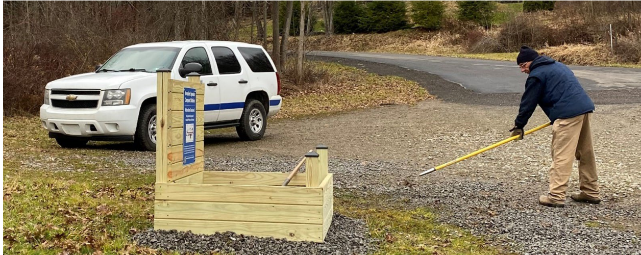
Figure 2. AIS Composting Station installation by PFBC staff.