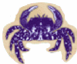
Japanese Shore Crab